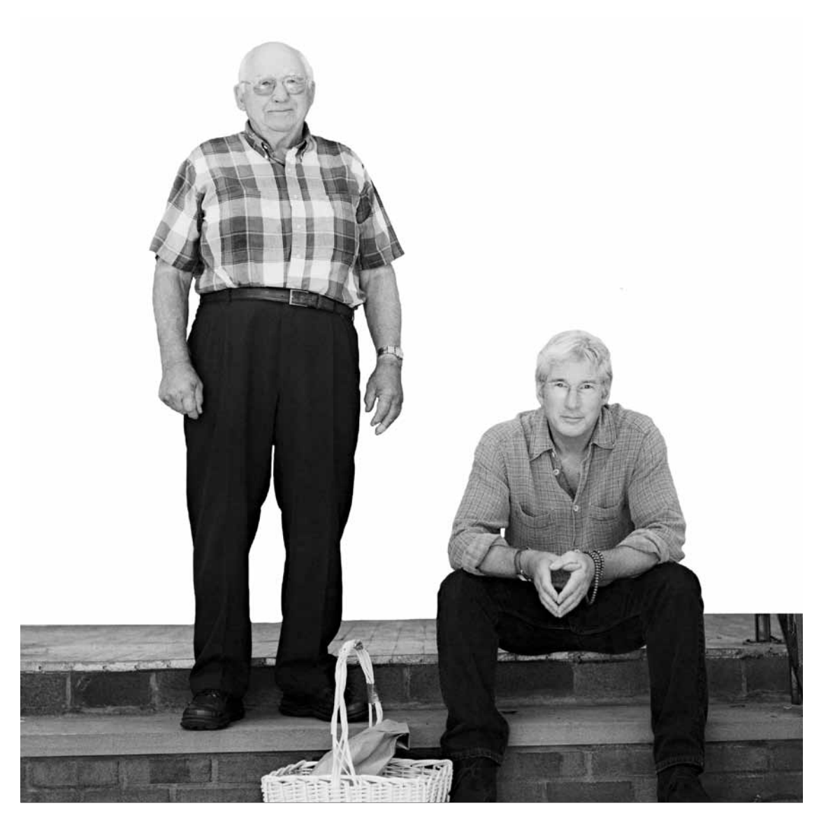
The Meals On Wheels Leadership Academy Course Catalog

Facts and figures will only take you so far. What both the media and your supporters really want is a good story—and your organization has plenty of them to tell! During this workshop, we'll explore the elements of a good nonprofit story and help you identify the great stories your program can tell today. We'll also look at how you can use your stories to get more press coverage and to inspire your volunteers, donors and other supporters to do even more for your program.